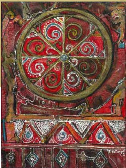
“Zlatni ketač” by Tatjana Hutinec

The “Zlatni ketač” (The Golden Wheel) painting is inspired by the old fashion custom and craft of spinning the wool, as well as the folklore ornaments from traditional clothes, woven textiles and lace used in handcrafted folk garments in the region of Hrvatsko Zagorje and Zagreb where Tatjana was raised.